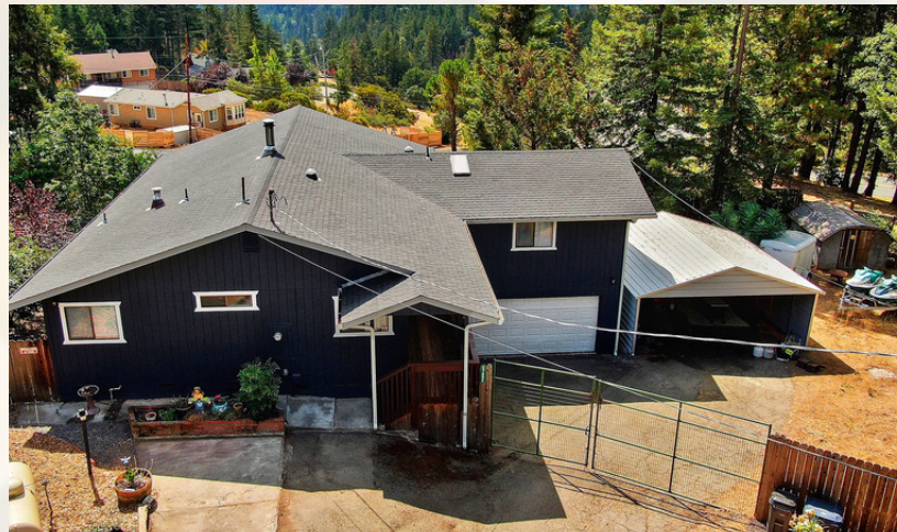
HAWK COURT, WILLITS WE GUARANTEE THE SALE OF YOUR HOME OR WE WILL BUY IT OURSELVES!