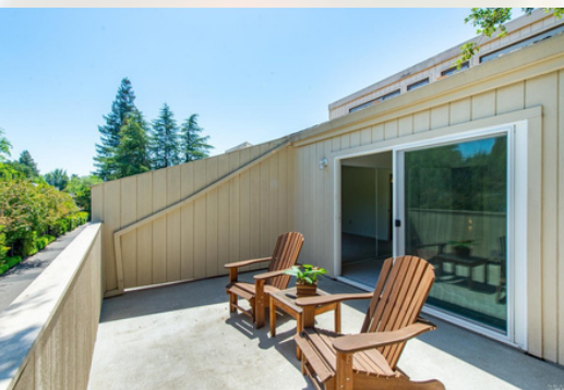
NORTH STREET HEALDSBURG

We currently have over 20,549 Buyers in our database, with more being added every day! We Had The Buyers For: