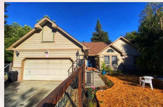
PERCH LANE WILLITS