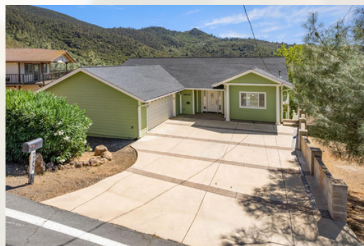
GRANDE VISTA KELSEYVILLE