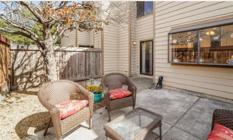
CEDAR TERRACE, SAN PABLO THIS HOME SOLD FOR 108.13% OF THE ASKING PRICE!